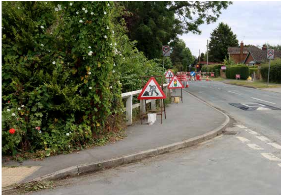
3rd November 2022 ►